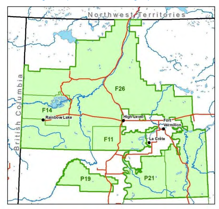
The UHFPAC region of operations is on following map:

The original Terms of Reference document for the PAC was drafted in 2003 and has since been revised periodically as appropriate. Effective 2022 the name of the Committee was changed from the High Level Forests Public Advisory Committee to the Upper Hay Regional Forests Public Advisory Committee. The new name was adopted to better reflect the geographical region of operations for Crestview Sawmills Ltd., Evergreen Lumber Inc., LaCrete Sawmills, Mercer Inc., Netaskinan, N'deh Ltd. Partnership, Norbord Inc. (West Fraser), Powerwood Inc, Tolko Industries Ltd. Hereinafter referred to as the Companies.